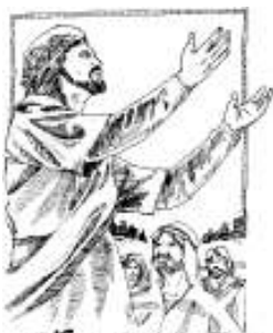
The Sermon on the Mount